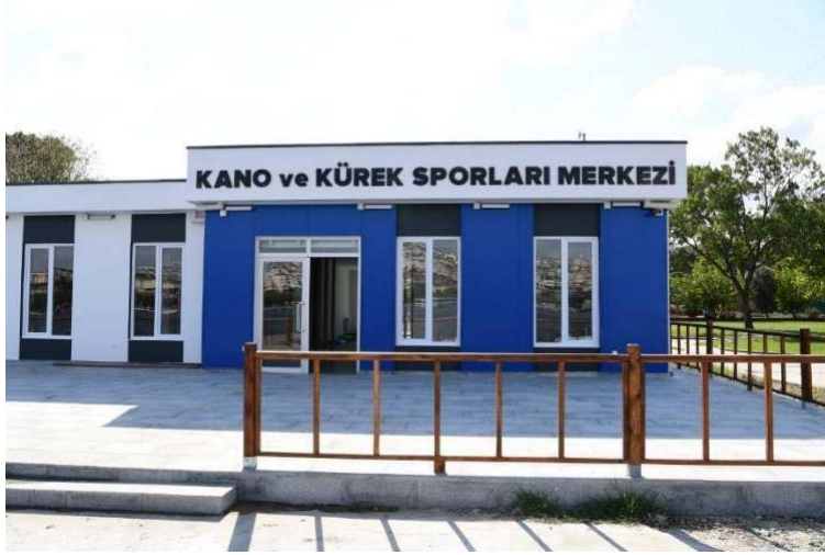
Fatih Municipality Canoe and Rowing Sports Center

Balat Hastanesi yanı, Ayvansaray caddesi, Park İçi Yolu, 34000 Fatih